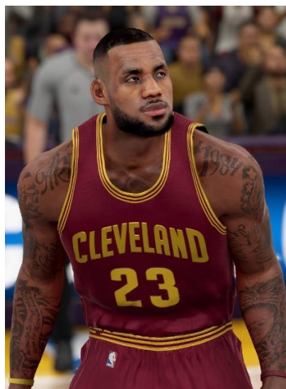
Figure 139: LeBron James’s likeness in NBA 2K videogame

4. The licensee of five tattoo designs inked on three different NBA players—Eric Bledsoe, LeBron James, and Kenyon Martin—sued the developer and publisher of the NBA 2K series of basketball simulation videogames for depicting animated versions of these players that included the licensed tattoos, as shown in Figure 139. The district court granted the defendants’ motion for summary judgment on the ground that they had an implied license to feature the tattoos in representing the players’ likenesses. Solid Oak Sketches, LLC v. 2K Games, Inc. , 449 F. Supp. 3d 333 (S.D.N.Y. 2020). The court reasoned that “(i) the Players each requested the creation of the Tattoos, (ii) the tattooists created the Tattoos and delivered them to the Players by inking the designs onto their skin, and (iii) the tattooists intended the Players to copy and distribute the Tattoos as elements of their likenesses, each knowing that the Players were likely to appear in public, on television, in commercials, or in other forms of media.” Are you convinced by each of the three parts of the court’s reasoning?