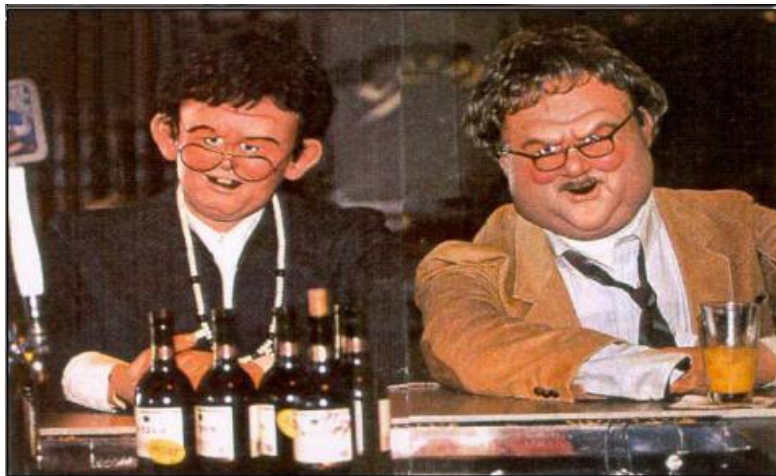
Figure 141: Norm and Cliff characters in Cheers television series (top), and robot figures in Cheers Airport Bar (bottom)

The Ninth Circuit rejected the defendants' argument that the claim was preempted on the basis that "the figures appropriate only the identities of the characters Norm and Cliff, to which Paramount owns the copyrights, and not the identities of Wendt and Ratzenberger, who merely portrayed those characters on television and retain no licensing rights to them. They argue that appellants may not claim an appropriation of identity by relying upon indicia, such as the Cheers Bar set, that are the property of, or licensee of, a copyright owner." In response, Wendt and Ratzenberger "concede[d] that they retain no rights to the characters Norm and Cliff; they argue .... that it is the physical likeness to Wendt and Ratzenberger, not Paramount's characters, that has commercial value to [the defendant]." The court accepted this characterization and ruled that this claim was not preempted by federal copyright law because it contained elements different in kind from copyright infringement.